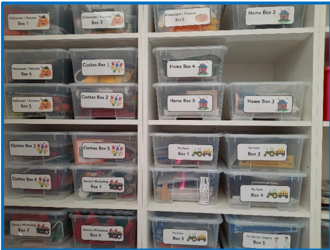
Aistear resources and new storage