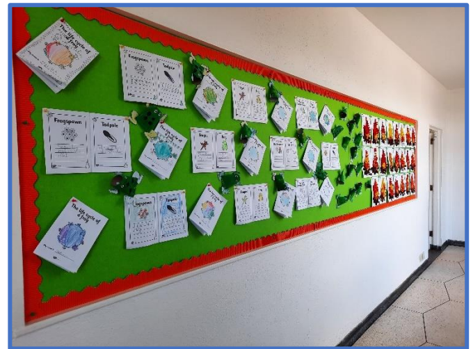
Refurbished Senior Infant Corridor

The following works are scheduled for summer 2021: Extensive roof repairs – funded by DES emergency works grant. Refurbishment of early intervention ASD classroom – funded by BOM. Refurbishment of first class corridor – funded by BOM and Parents’ Council.